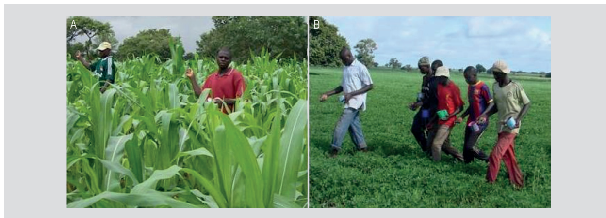
Figure 1. Farmers applying Aflasafe in maize in Nigeria (A) and Aflasafe SN01 in groundnut in Senegal (B).

testing in Ghana, Malawi, Mozambique, and Tanzania. New Aflasafe product development for other nations in Africa would be regional ones when appropriate.