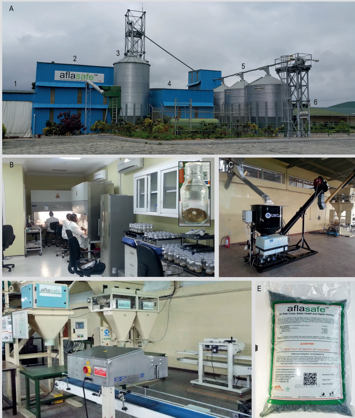
Figure 2. (A) External view of the Aflasafe demonstration-scale manufacturing plant at the IITA campus in Ibadan, Nigeria. The plant consists of: (1) grain intake pit; (2) sorghum debearder and a 3-stage grain cleaner; (3) a grain silo of 100 ton capacity to store clean grains; (4) roaster to sterilise grains and cooler to cool the hot roasted grains; (5) three grain silos of 50 ton capacity each to store sterilised grains; and (6) inoculum production and quality control laboratories. (B) Laboratory where inoculum is produced en masse . Inset: bottle containing sorghum colonised by an atoxigenic isolate; spores are harvested to prepare a spore suspension for biocontrol formulation. (C) Commercial seed treater to coat sterile sorghum grains with a spore suspension containing one isolate each of four atoxigenic VCGs. (D) Weighing and packaging lines of coated products. (E) A finished package of Aflasafe product.

was to eventually seek expressions of interest by private and/or public sector organisations to take over manufacturing. Several companies have expressed interest to manufacture