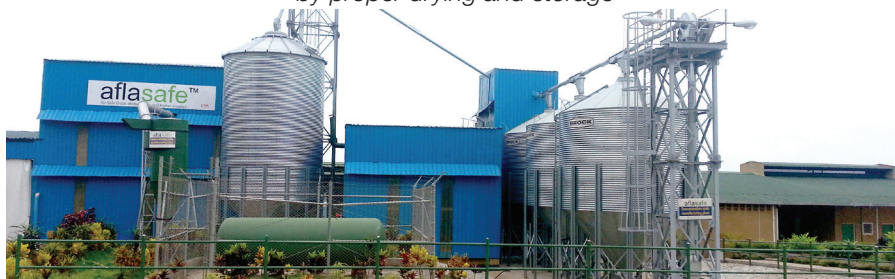
The Aflasafe manufacturing plant at IITA's Business Incubation Platform in Ibadan, Nigeria.

Aflasafe's protection continues postharvest, and is further optimised by proper drying and storage