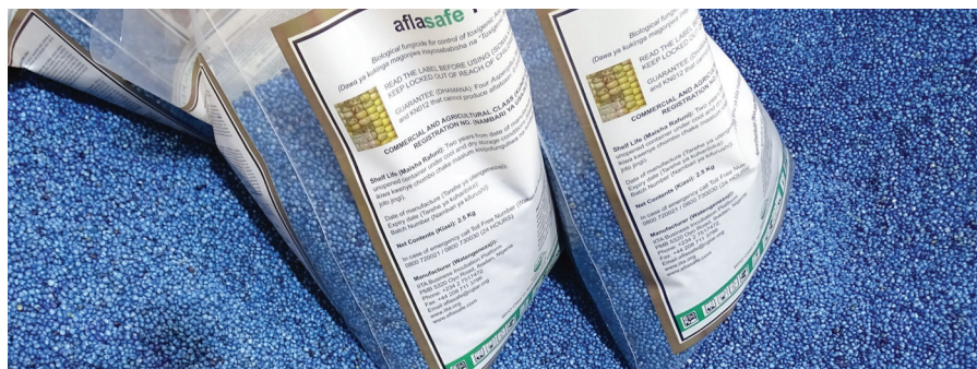
Aflasafe is currently packed in handy 2.5- and 5-kilo bags for easy application by smallholders.